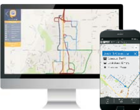
New public websites and mobile apps

Finally, an ITS that evolves to meet your needs now ... and in the future.