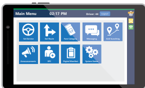
User interface improvements

Always the latest capabilities & features: