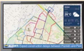
Leverage high-definition LCD displays to provide riders with announcements, route tracking, and other information.

Climb on board with the value leader in complete transit systems.