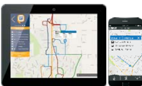
Public websites and apps

Imagine a future where you can access the entirety of your transit operations from any Internet-connected device. All the planning, reporting, scheduling, and communication tasks powered by a single interface that unifies hardware, software, vehicle and human elements into a single, powerful tool. Your new transit system will quite literally move at the speed of light.